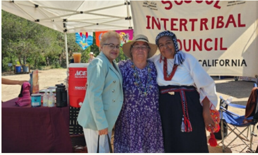
28th Annual Suscol Intertribal POWOW Oct 1-2, 2022, Skyline Park, Napa, Ca