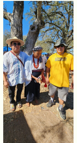
Thank you to the Head Staff, Dancers, Singers, the Drum, Vendors, Volunteers and to all who attended