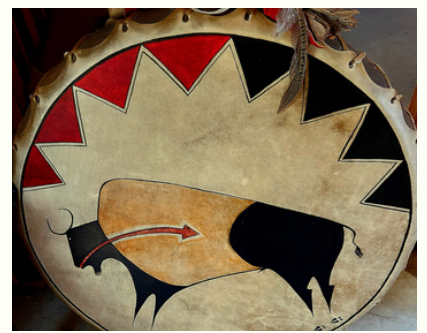
Thank you to all the Artists, Donors and Bidders for an amazing turnout for our 26th Annual Art Auction